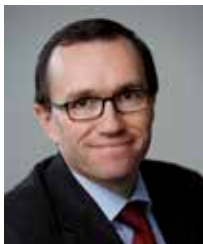
Espen Barth Eide